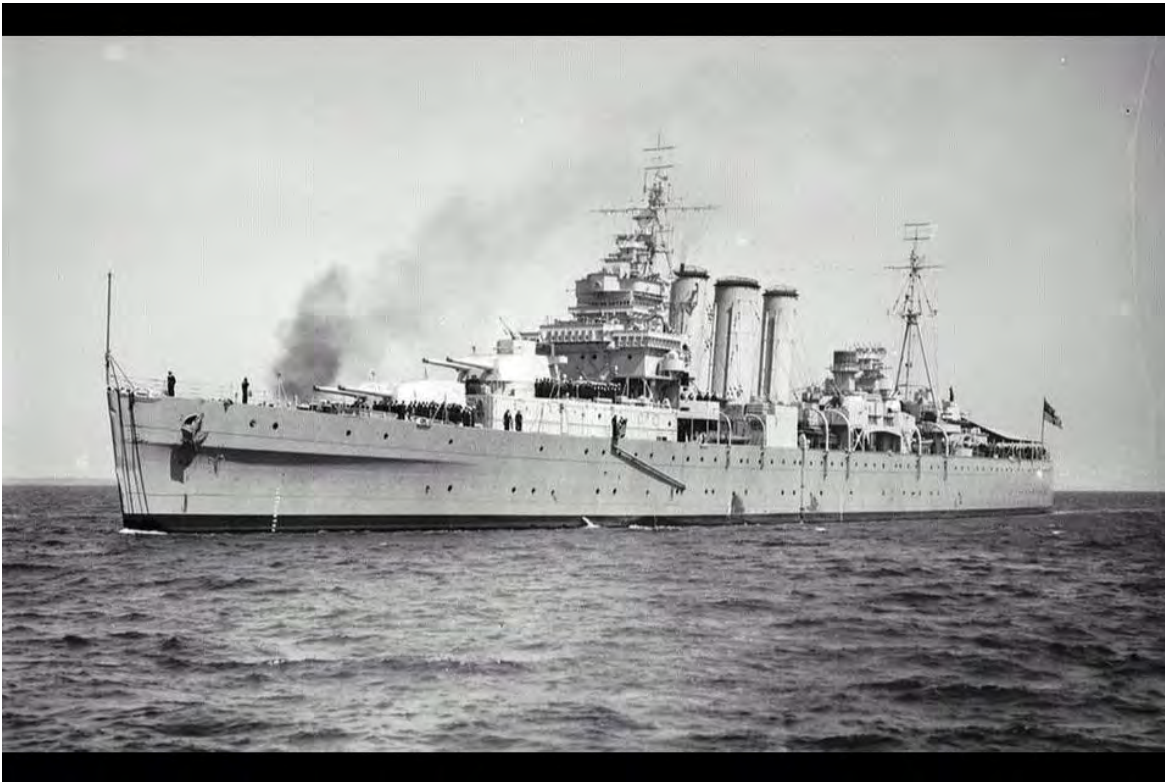
Picture of HMAS Shropshire found on Ebay for sale.