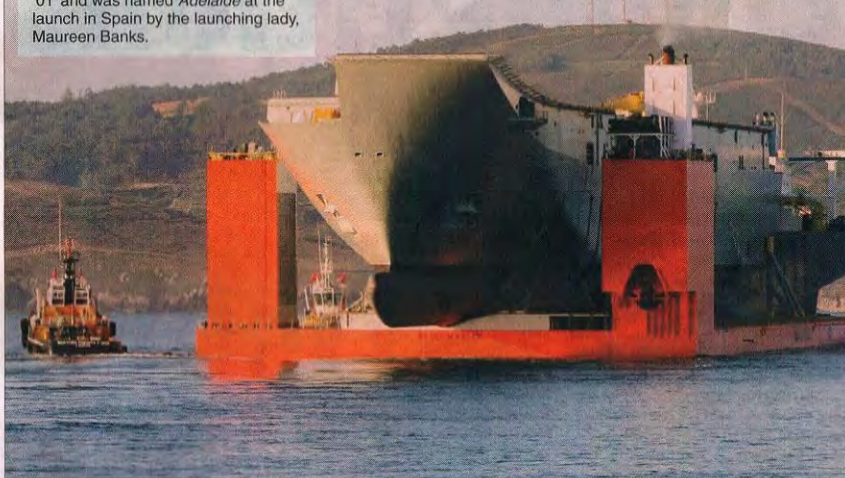
AUSTRALIA BOUND: The first hull of Navy's new amphibious ships departs from Ferrol in northern Spain. Right, the hull was loaded onto Blue Marlin in a significant engineering feat that involved submerging the heavy lift vessel so the hull could be floated onto it.