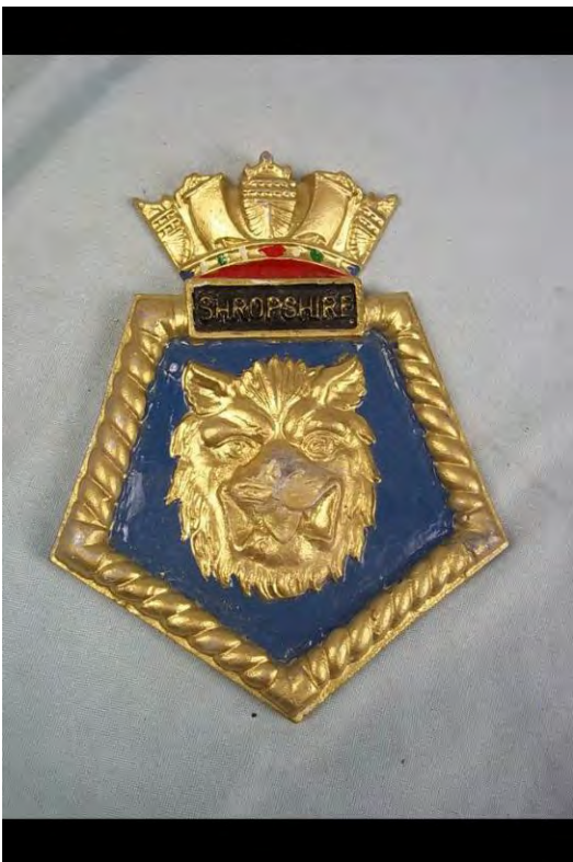
One off casting in aluminium of HMAS Shropshire crest – so the ad read on Ebay!